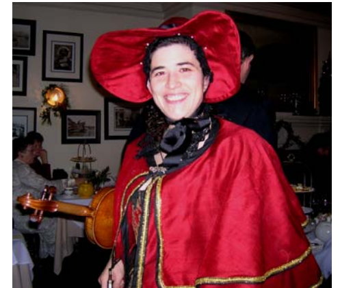
At the 2007 Dickens Tea fundraiser