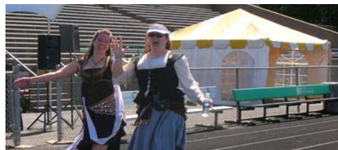
Team Wench members at the 2006 American Cancer Society Relay for Life

Team Wench, Inc. is a 501(c)3 non-profit all-volunteer organization, and its members receive no income from their work. Team Wench and its members have donated more than $175,000 to charity since its inception.