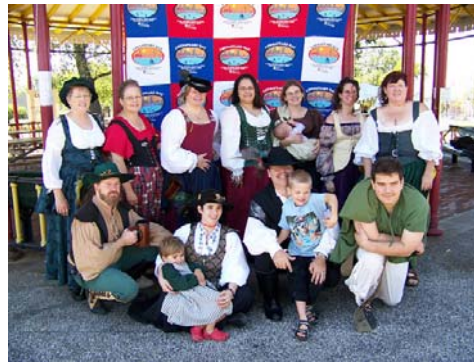
The Team Wench lunch crew at the 2007 Bay Challenge MS Walk

As several members of the Team have MS, Multiple Sclerosis was the obvious focus when the Team decided to add a second fundraising feast to their annual schedule. In 2004 the Team added the MS Fantasy Ball. The Ball raised nearly $4,600 that year and sponsored three participants in the NMSS Chesapeake Challenge 3-Day Walk.